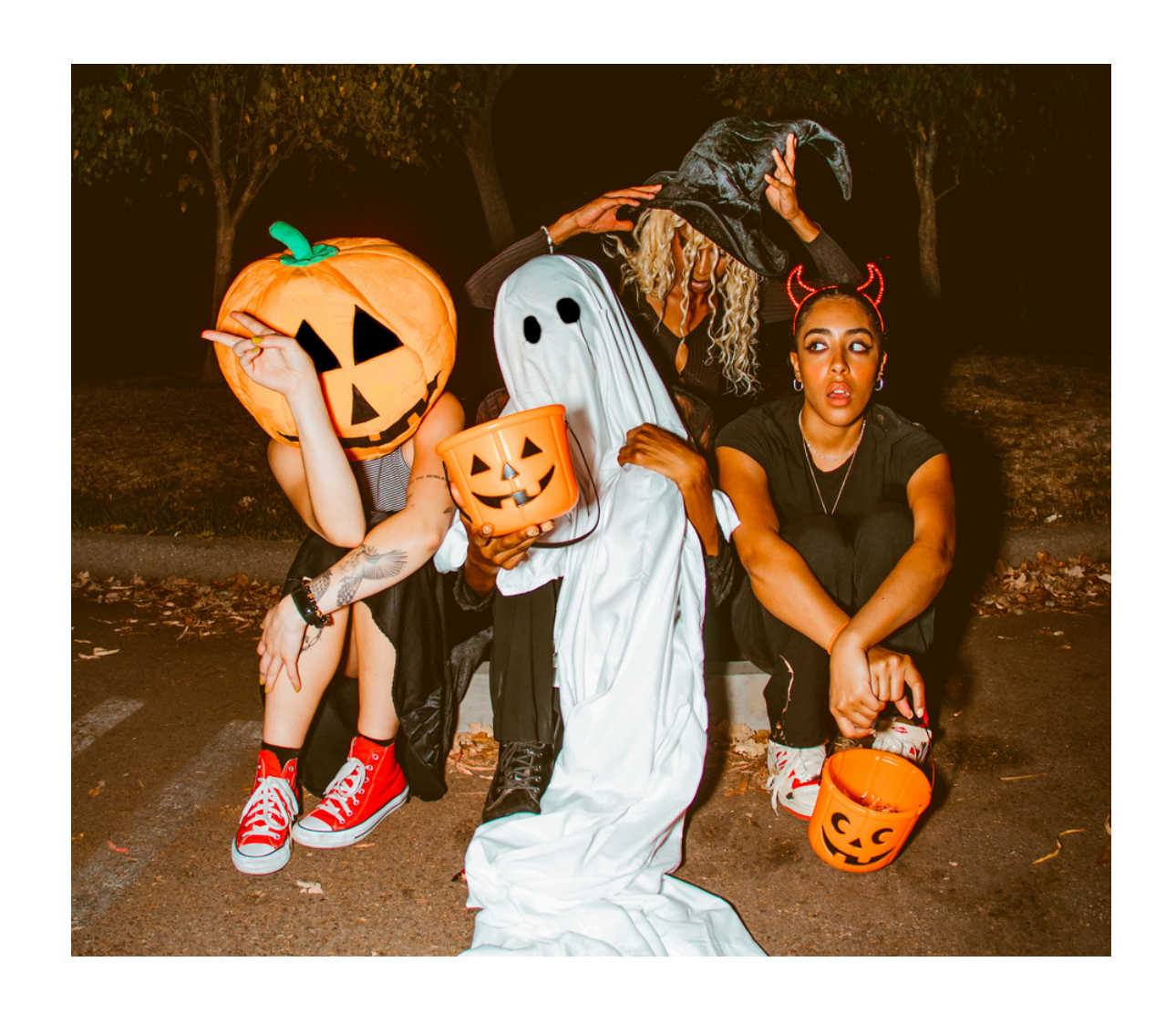
When I go trick-or-treating I can decide if I want to wear a costume or not.